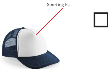
CAPPELLO FAN C/STAMPA 15€