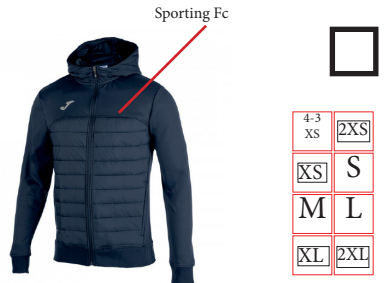
GIACCA BERNA 36€