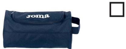
BEAUTY JOMA 7€